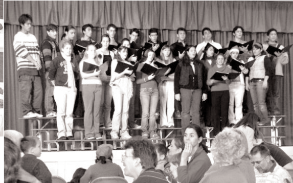
Entertainment at the party was provided by the Gunn High School Chamber Singers.