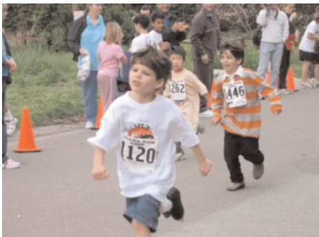
Kinders run the quarter mile.

The day started at 8:30am with the 8K race. The kid races started at 10:00am with fifth grade boys running a half-mile, then the fifth grade girls, then the fourth grade