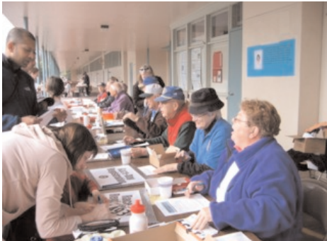
Volunteers register the runners.