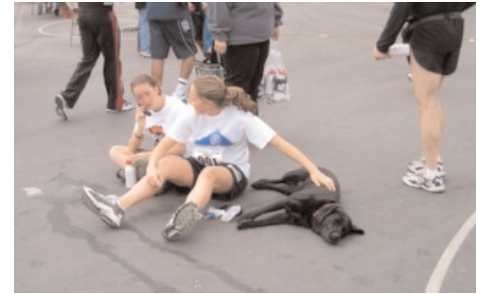
Some runners got dog tired.

The awards ceremony immediately followed our fifteen minutes of shame. The top placers of each division of the kids’ races selected a toy or book and bib numbers were pulled and called out for raffle prizes. Many of the would be winners were not present or had thrown away their child’s bib when they were re-bibbed for the mile race, so next year, remember