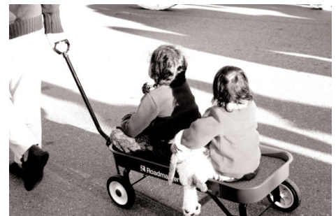
Some people had it easy.