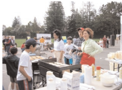
Pancake breakfast for 8K runners.