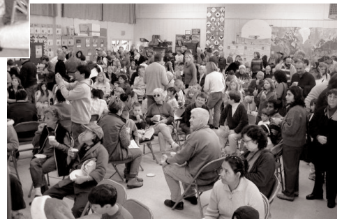
The appreciative audience filled the multipurpose room at Barron Park Elementary School.