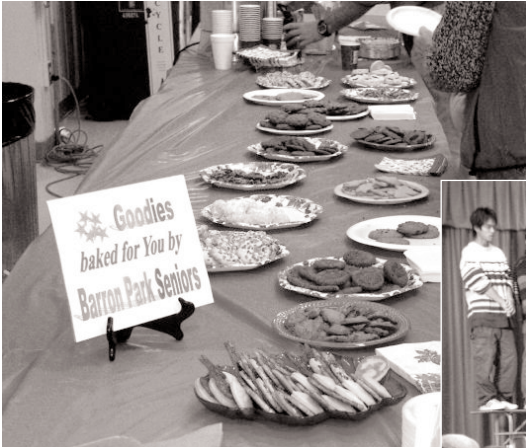
Delicious cookies were baked by the Barron Park Seniors.