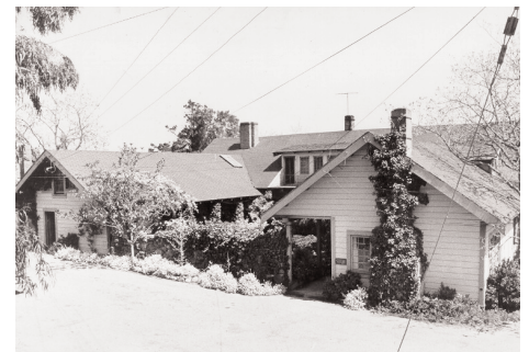
This shows the west side in 1963—there have been no major changes since, except for vegetation growing up.

Volunteer. Partner with committed, energetic Bay Area community members. Share your expertise in grant writing, fundraising, publicity, filmmaking, and information management. Please contact: chair@brioneshouse.org .