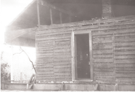
This photograph, from 1903, shows the tamped earth between redwood slats.

the county except for a few temporary herder's huts. It is the oldest surviving structure this side of Santa Clara Mission.