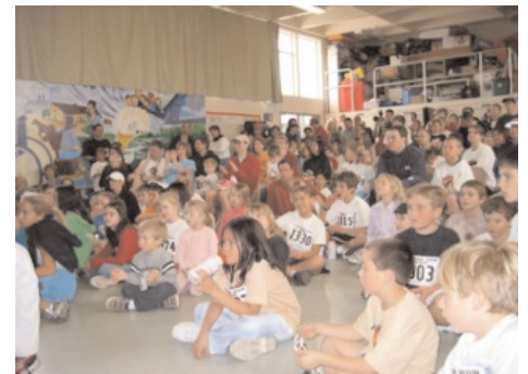
Awards ceremony in the Juana Briones multipurpose room.