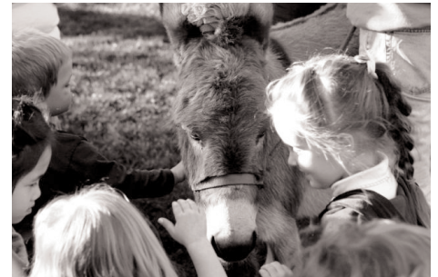
Neighborhood children had a chance to meet our donkeys at Bol Park before the event.