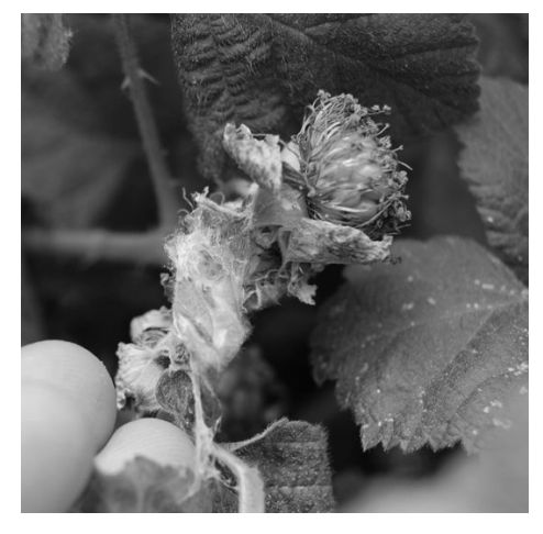
LBAM larvae spin a protective tent of white fibers, often in a curl of leaf or a crevice in the fruit, where the pupae mature. If you find foliage in your yard with evidence of the LBAM, please dispose of it in the city compost bins.

In other good LBAM news, the state released a map at the end of February that clearly excludes our neighborhood from any potential aerial spraying of pheromones. The LBAM eradication plan allows for spraying only in "essentially unpopulated" areas, defined as fewer than 100 residents per square mile, and excluding urban parks and environmentally sensitive areas.