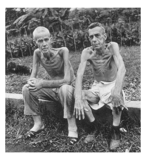
Photo G: Two former roommates of Carl's at Santo Tomas, Manila, 1945.

The Mydans team returned to the Pacific in late 1944, where Carl covered the Leyte landing and then the landing at Lingayen Gulf on Luzon—right where the Japanese had come ashore in 1941. Carl produced some of the most notable photographs of the war in the Pacific, including the iconic picture of General MacArthur wading ashore at the invasion of Luzon—the photo that came to symbolize the return of the United States to the Philippine Islands (see photo F, MacArthur).