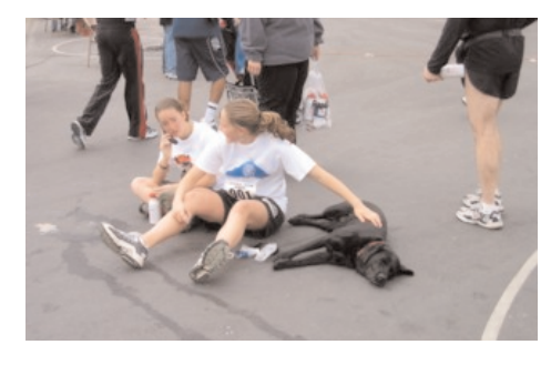
Some runners got dog tired.

The awards ceremony immediately followed our fifteen minutes of shame. The top placers of each division of the kids' races selected a toy or book and bib numbers were pulled and called out for raffle prizes. Many of the would be winners were not present or had thrown away their child's bib when they were re-bibbed for the mile race, so next year, remember