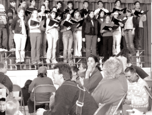
Entertainment at the party was provided by the Gunn High School Chamber Singers.