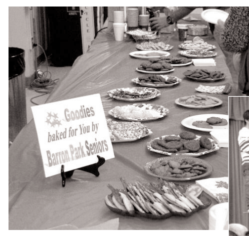
Delicious cookies were baked by the Barron Park Seniors.