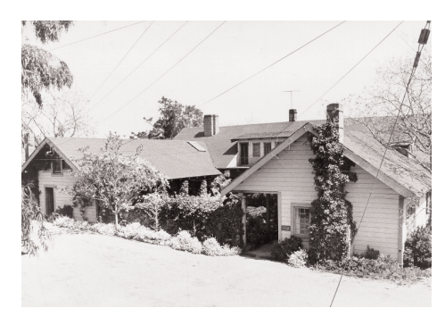
This shows the west side in 1963—there have been no major changes since, except for vegetation growing up.

Volunteer. Partner with committed, energetic Bay Area community members. Share your expertise in grant writing, fundraising, publicity, filmaking, and information management. Please contact: chair@brioneshouse.org.