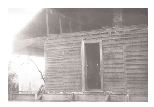
This photograph, from 1903, shows the tamped earth between redwood slats.

the county except for a few temporary herder's huts. It is the oldest surviving structure this side of Santa Clara Mission.