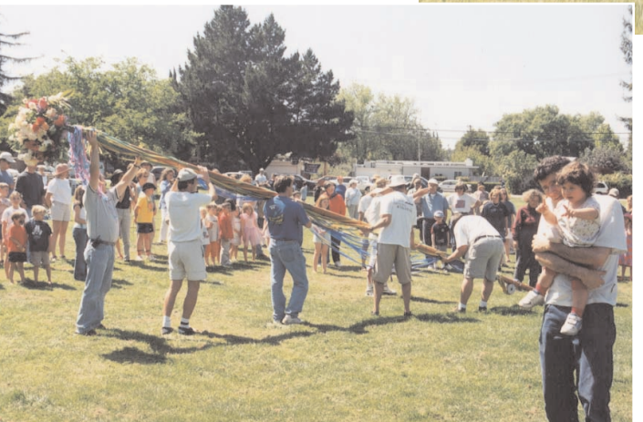
Placing the pole in the ground.