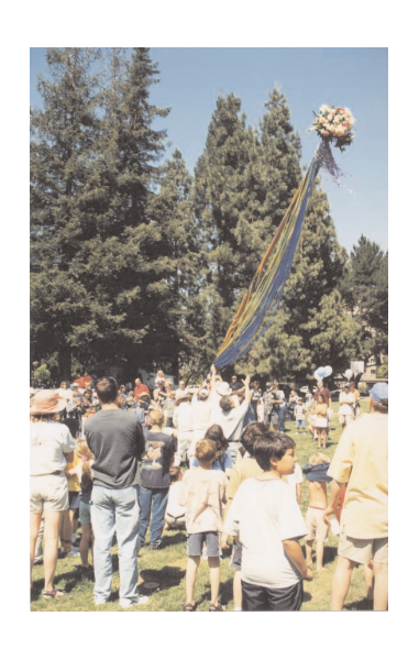
Raising it up.