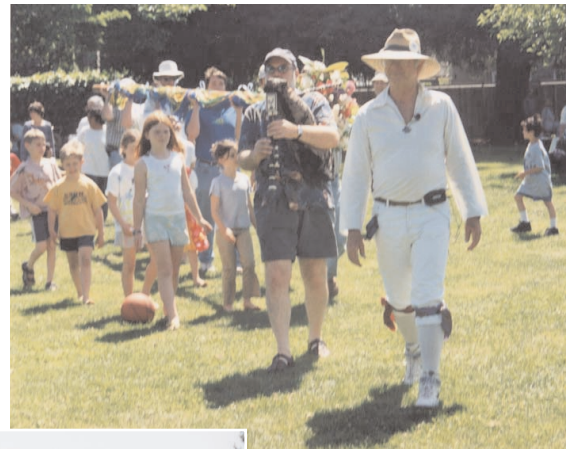
Left: Finding the place. Right: Piping in the maypole.