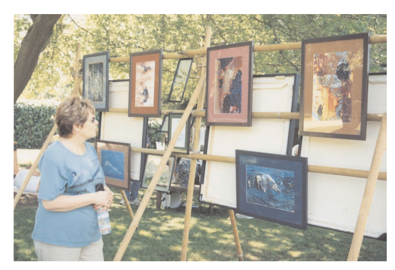
A potential buyer views some of the art.