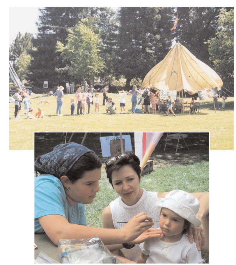
There is always a long line at the face painting tent.