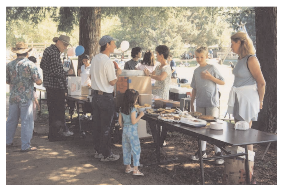
Food service: soft drinks, burritos from Seno Taco, and the PTA bake sale.