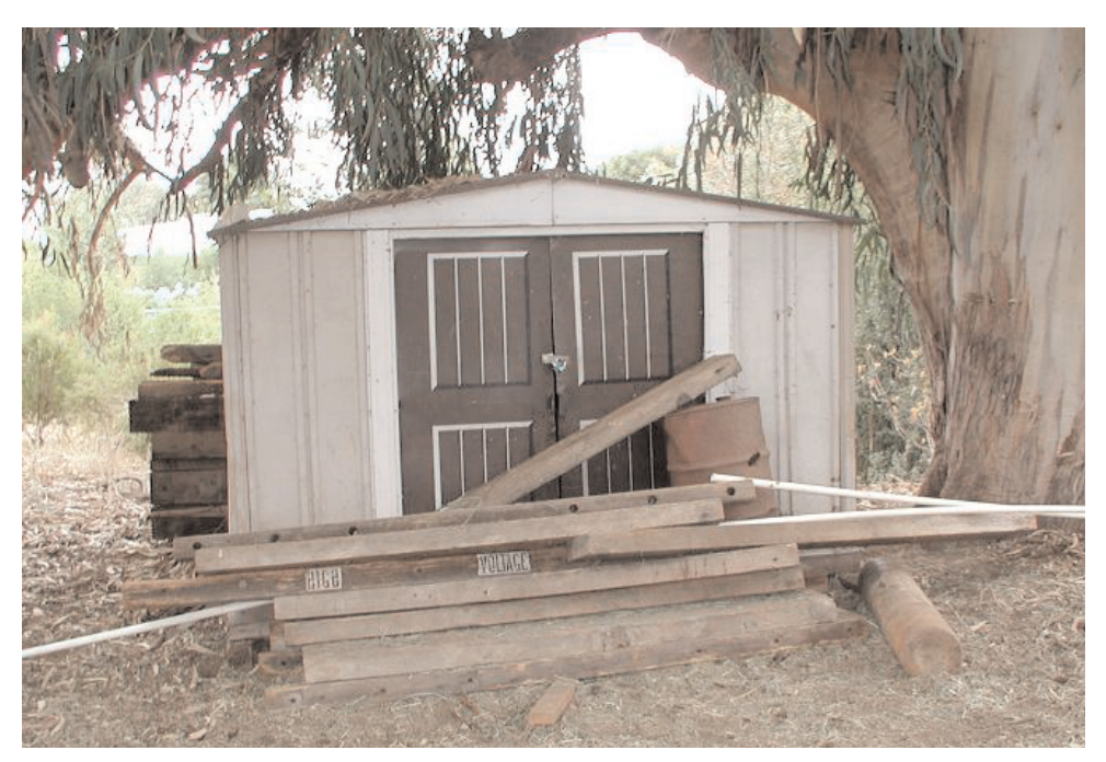
Elegant barriers erected by donkey handlers somehow proved ineffective.

The Barron Park donkeys, Perry and Niner, have had a busy time in the L late summer and fall. Back in July and August, the boys learned that persistent head butting was a very effective way to crash through the door to their feed shed, resulting in all-you-can-eat meals on demand. The donkey handler crew resolutely built barriers of stacked up wooden planks, old oil drums, etc. to block the donkeys' path to the shed. Perry and Niner just as resolutely crashed through all the barriers - and the door — repeatedly foiling their caretakers and accessing an unlimited supply of alfalfa. In desperation a temporary chain link barrier was erected, and at last, mankind triumphed over the beasts of burden. It turned out that the fellow from Express Fence, from whom the fence was rented, used to own a donkey himself. He issued an iron clad donkey-proof guarantee, and he was right, although Perry and Niner mounted a good assault before admitting defeat. Eventually James Witt, owner of the donkey paddock and carpenter extraordinaire, found a way to reinforce the shed doors to prevent untrammeled donkey access - for now. The fence came down for good in September.