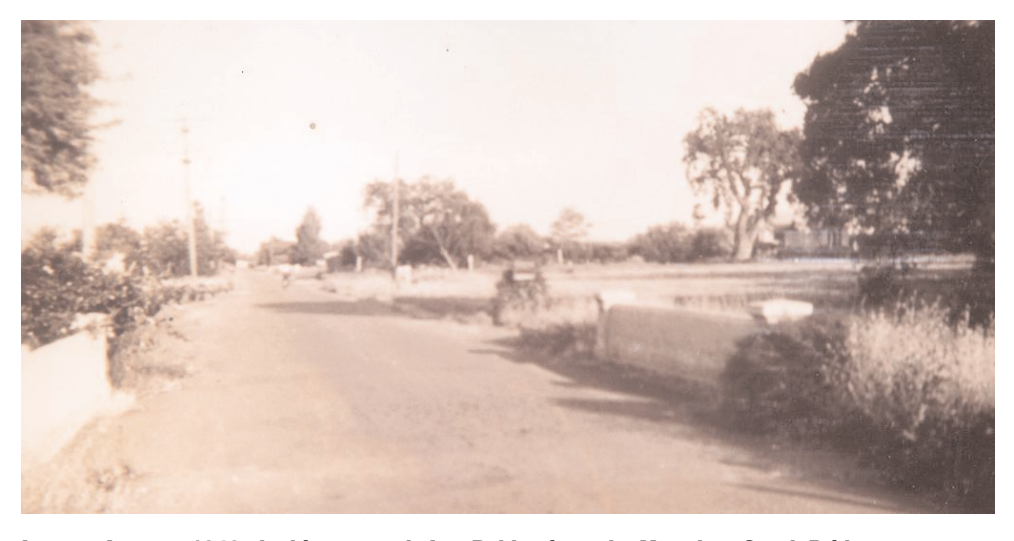
Laguna Avenue, 1946—looking towards Los Robles from the Matadero Creek Bridge.

Bayshore Road, Palo Alto, CA 94303. ACTER-RA is an umbrella organization that handles the donkeys' insurance, and maintains an account for the Donkey Project. Contributions help pay for alfalfa, veterinary and farrier services, and incidental supplies.